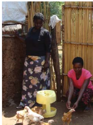
Two Girls from Sio Port Observe Chicks in a Demonstration House Run – 2010

Cardno is continuing its innovative partnership with the Nike Foundation to develop a model for economically empowering adolescent girls and young women by increasing their participation in high-return value chains in both the poultry and vegetable sectors. We work with young women between the ages of 18 and 24 in the Western and Nyanza provinces of Kenya by organising them into producer groups; providing them with training in governance, business management, technical skills, financial literacy and savings management; and linking them to lead firms. These activities will give the girls an opportunity to break out of social isolation, increase their income and contribute to their community's development.