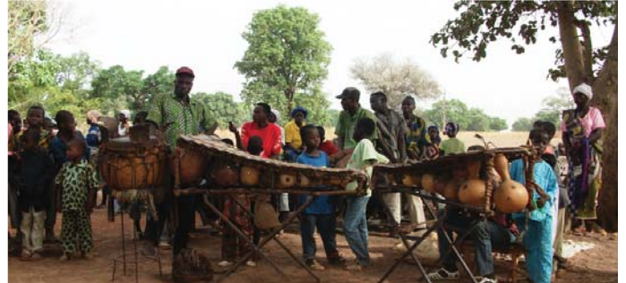
Katolo Village Gathering, Burkina Faso – 2010