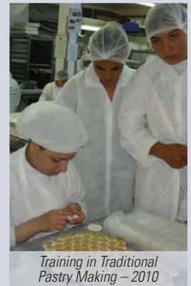
Training in Traditional Pastry Making – 2010

The initiative is targeted at creating long-term sustainable benefits for communities around BG's Liquid Natural Gas (LNG) site. This project – the first of its kind in Tunisia to be run in the private sector – includes micro-financing to support entrepreneurship, vocational skills training and also specialist training opportunities designed for women. Loans were granted to finance irrigation and livestock rearing as well as a greenhouse. Meanwhile, the first group of 45 young men and women have gained new skills in high demand areas such as welding, scaffolding, car mechanics, sewing and pastry making. We are concluding discussions with BG Tunisia for Phase 3 of the program which involves upgrading the curriculum of the local vocational training center, supporting the establishment of a women's vocational training centre and developing a microfinance program for small scale enterprise development in the agricultural sector.