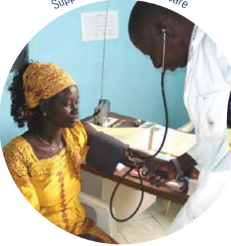
Supporting rural medical care